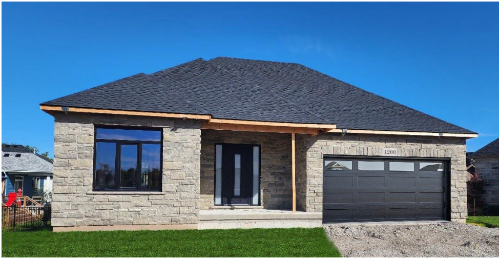
"Note: Grass & garage door have been added to the photo for visual representation of finished home."